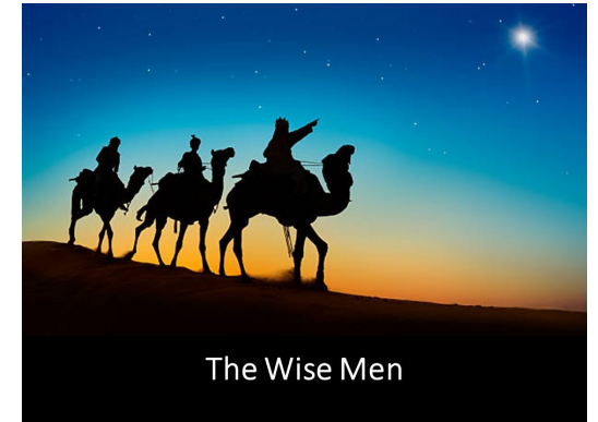
The Wise Men